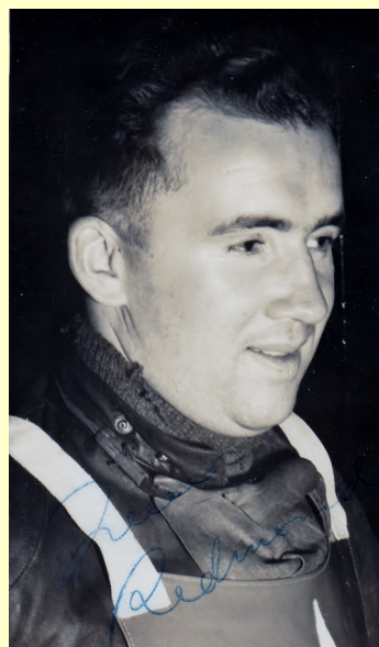
& Trevor Redmond