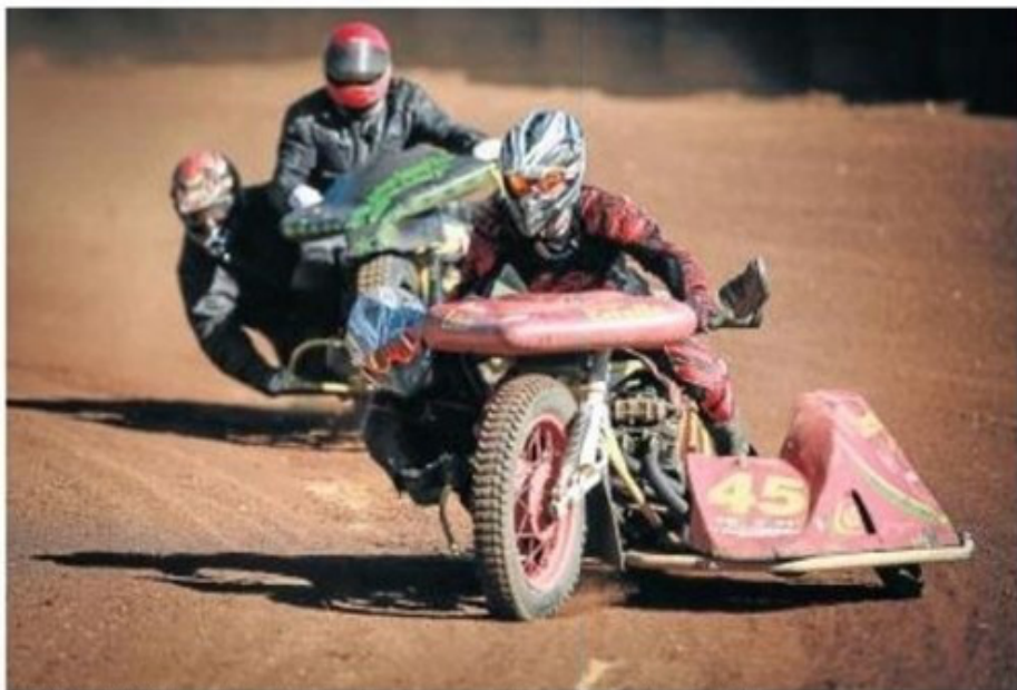
100811 T.M.C. 100811 T.M.C. 100811

DOCTORS in the US have found a tooth growing inside the nose of a patient. The doctor says the tooth is a wisdom tooth and it is growing in the wrong place. The doctor says the tooth is a wisdom tooth and it is growing in the wrong place.