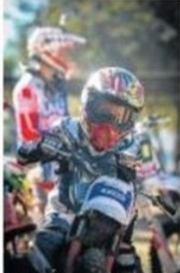
100811 T.M.C. 100811