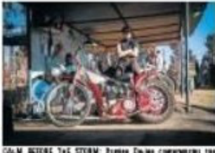
100811 T.M.C. 100811