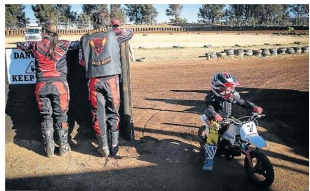
TYKE ON A BIKE: A youngster gets rolling on his on a 50cc 'Pee wee'