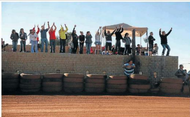
TRACKERS: The circuit has been operating in its present guise since October 2006