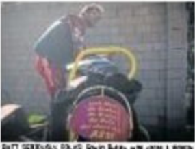
100811 T.M.C. 100811