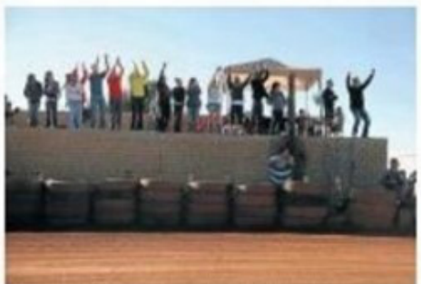
100811 T.M.C. 100811