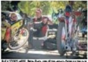
100811 T.M.C. 100811