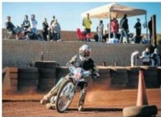
100811 T.M.C. 100811