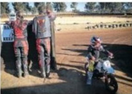
100811 T.M.C. 100811