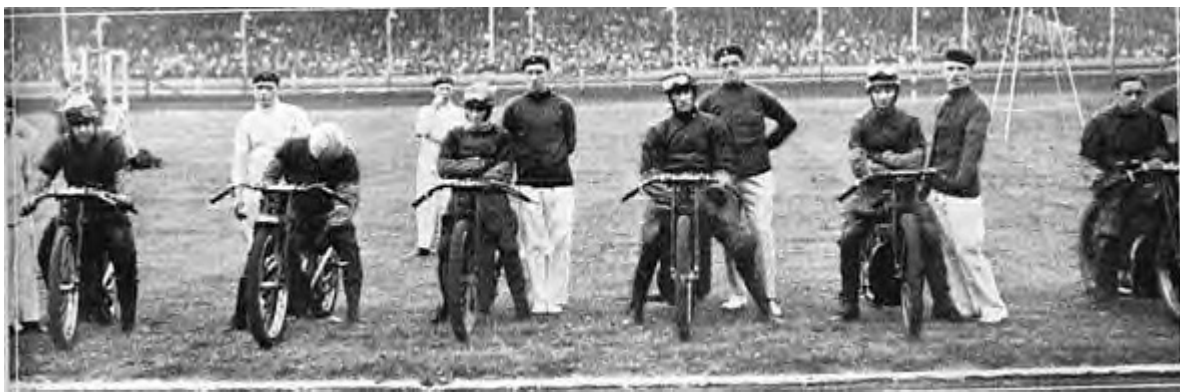
THE AUSTRALIAN TEAM AT THE FIRST OFFICIAL TEST MATCH AT WIMBLEDON ON MONDAY, JUNE 30, 1930.